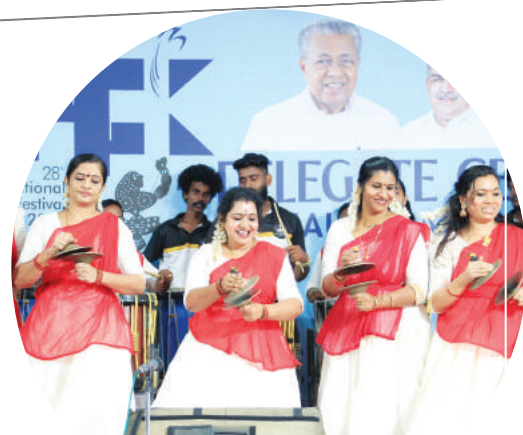
കേരള സെക്രട്ടേറിയറ്റ് എംപ്ലോയീസ് അസോസിയേഷൻ അംഗങ്ങൾ അവതരിപ്പിച്ച സംഗീതപരിപാടി